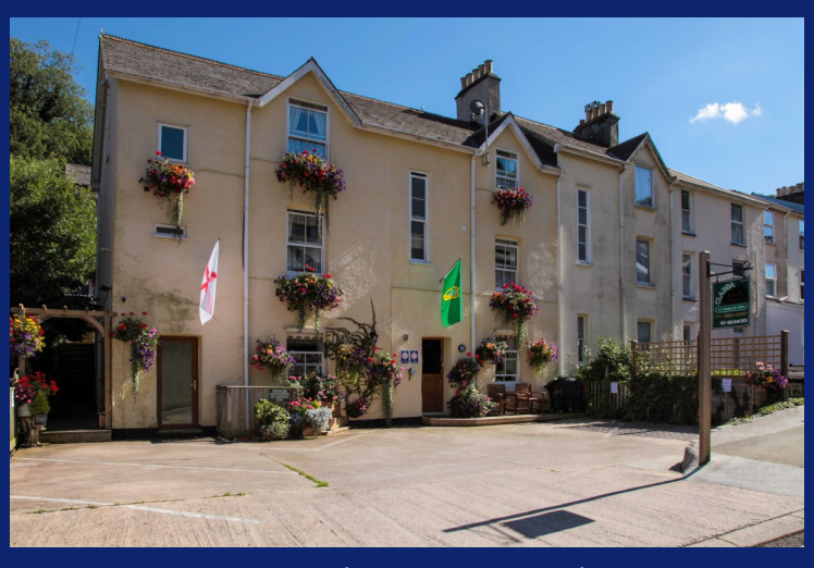
Guaranteed FREE onsite parking